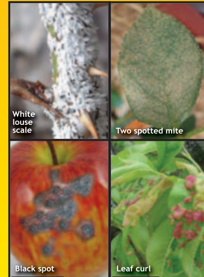
White louse scale

For the control of certain diseases, insects and mites on apples, pears, stone fruit, grapes, roses, hedges and vegetables in the home garden.